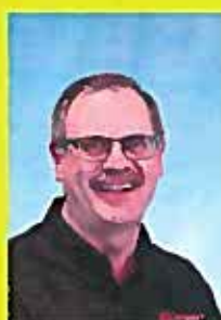
Dale Middle East